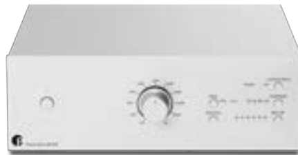
Phono Box DS3 B