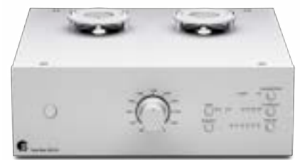
Tube Box DS3 B