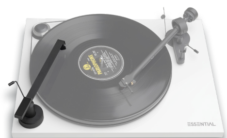
Type 3 Outside motor with or without speed switch button

If the motor and speed button are in the left corners, the record broom can be placed immediately to the right of the speed button.