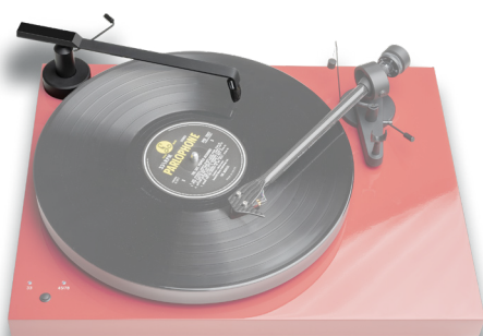
Type 1 Motor under platter

The record broom can be placed in one of two left hand side corners of the turntable. The placement is depending on the type and shape of your turntable. At the optimal position the brush should align with the spindle (i.e. the center of the platter). Deviations (relative to the spindle) between 1,5 to 2 cm are well compensated by design of the Sweep it S2. Higher deviations can cause more drastic skating effects.