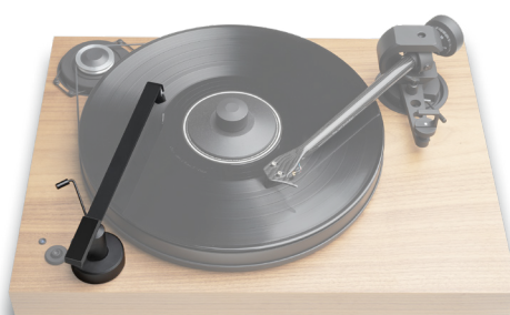
Type 2 Outside motor with speed switch button

If there is enough space, the upper left corner is an ideal place for the record broom.