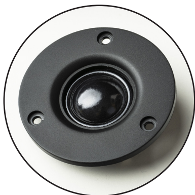
1" silk dome tweeter

For transparent and smooth treble response.