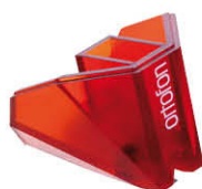
2M Red / Verso