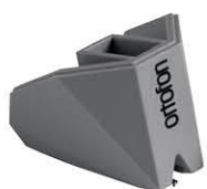
2M 78 / Verso

The 2M Bronze features a Nude Fine Line diamond stylus, which is particularly suited for demanding applications. The