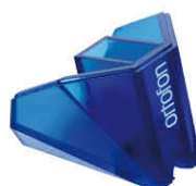
2M Blue / Verso