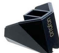
2M Black / Verso