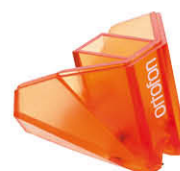
2M Bronze / Verso