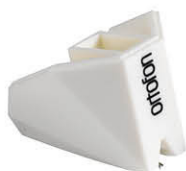
2M Mono / Verso