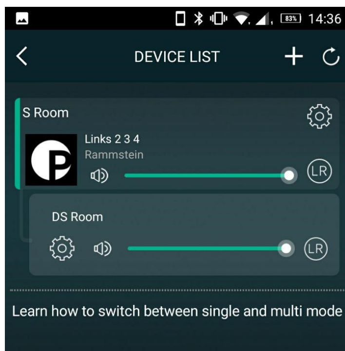
Paired Multiroom Stream Box S2's

Multiroom In-App Configuration: Drag & drop Stream Boxes on top of each other to pair them and play the same music in different rooms simultaneously! Bonus Features: control volume levels shared or individually and configure left and right channel assignments.